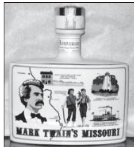
Mark Twain's Missouri Decanter