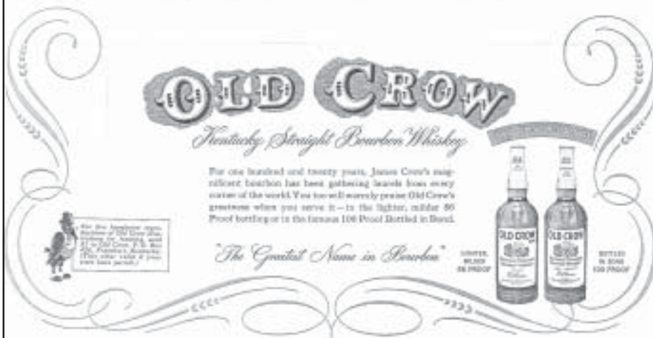
Old Crow Ad -- Twain at Klaproth's Tavern

The famous humorist queries the bartender at Klaprotti's Tavern in Elstira, New York, about the current supply of his favorite bourbon, Old Crow.