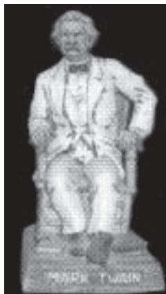
The Lionstone Twain Decanter