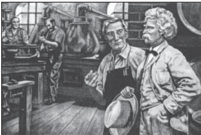
Old Crow Ad -- Twain at the Distillery

The ad, shown here, depicts a mature, seated Twain while Harte is standing as if in the midst of a discourse. The scene could never have happened. Although Twain and Harte had been youthful friends, later in life they had become