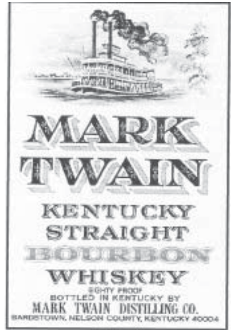
Label -- Mark Twain Bourbon

No whiskey, however, can match Old Crow for latching onto the aura of Mark Twain. In a series of ads that ran in national magazines like the Saturday Evening Post and LIFE during the late 1950s and early 1960s, Twain is shown in various situations, including holding forth at a tavern, conversing with other notable contemporaries over a glass of bourbon, and as shown here, visiting the distillery