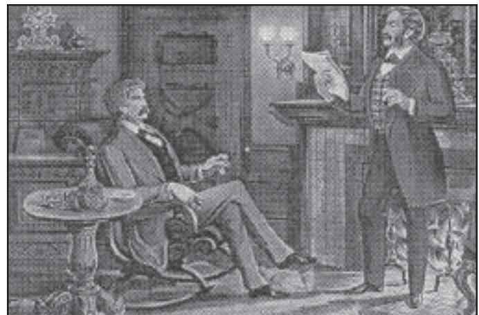
Old Crow Ad -- Twain and Bret Harte