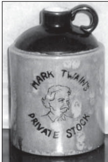
Mark Twain's Private Stock jug