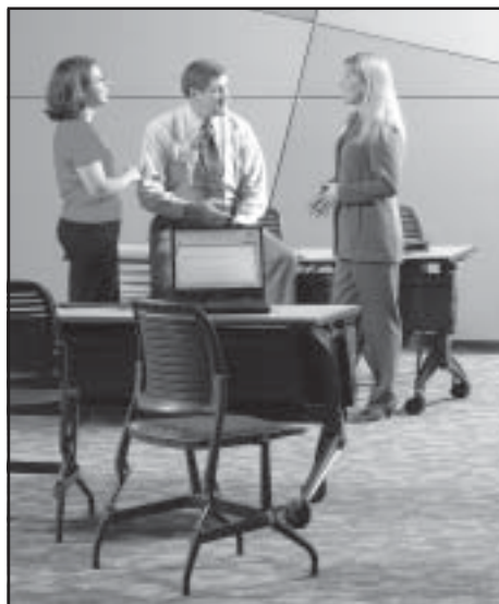
DeVos Place meeting rooms.