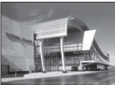
Exterior of DeVos Place, Grand Rapids.

There are also five excellent museums within walking distance. The Public Museum of Grand Rapids will be hosting a major traveling exhibit from July 2 nd to October 31 st entitled: "Cherished Possessions: A New England Legacy," featuring 175 artifacts reflecting family