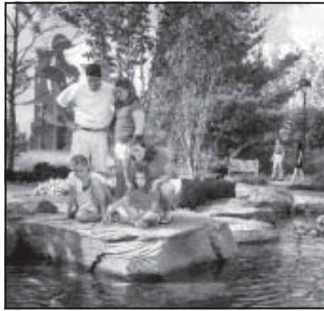
The Frederik Meijer Gardens

Michigan is a water-lovers paradise. We have 11,000 miles of inland lakes and more coastline mileage than any other state except Alaska. In the neighboring coastal communities of Saugatuck or Grand Haven 30 miles to the west, you could take a sunset cruise, or pilot a boat yourself and cruise past the lighthouses which dot the coastline. You could also rent a Jet Ski, kayak, or reel in "the big one" on a charter fishing trip. For landlubbers, other options include a scenic off-road sand dunes ride or just relax and dig your toes into one of the many miles of sandy beaches. From Grand Rapids, 42 miles northwest is Muskegon, the home of "Michigan's Adventure" an amusement and water park with over 50 rides and water slides. These