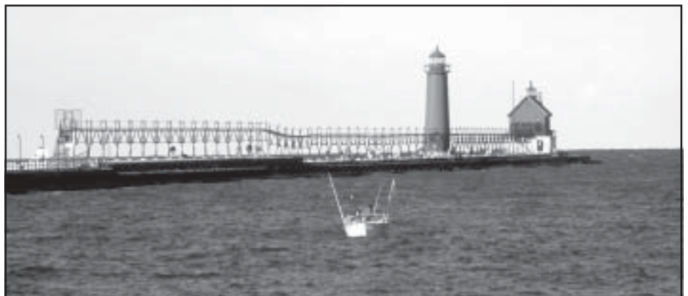
Fishing at Grand Havens