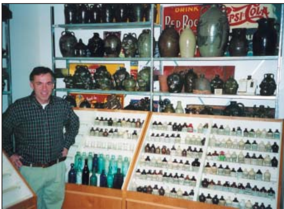
Here's another view of the Watkinsville, Georgian collection of mini jugs, face jugs and bottles.

He concluded, "I was very glad to see the quality of items listed in the National Auction and to be fortunate enough to be the high bidder."