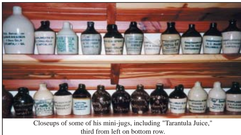
Closeups of some of his mini-jugs, including "Tarantula Juice," third from left on bottom row.