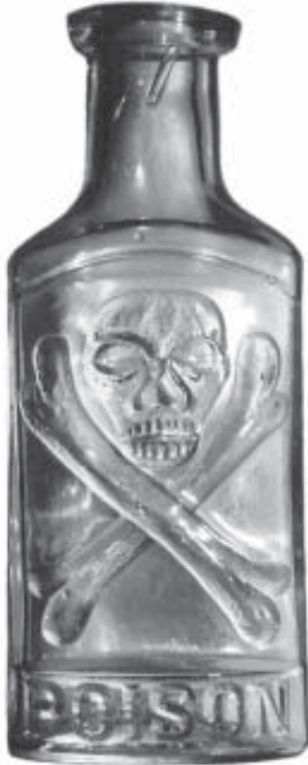
This is the ultra-rare KR-79 poison bottle, of which only two specimens are known to exist, although there are rumors of the existence of several others.

or colors of previously categorized types, but some have been brand-new types. Let's end this article by looking at two such bottles: KC-114 and KR-79 . Knowing Rudy Kuhn's classification system, by the way, instantly tells us that the former is cylinder-shaped and the latter is rectangular-shaped.