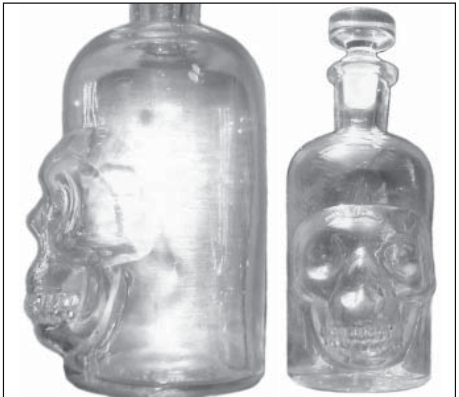
Shown is the close-up side view and front view of another ultra-rare poison bottle (KC-114), which was patented in 1875, according to its base embossing. It comes in two different sizes. All of the half-dozen or so known specimens have ground-glass stoppers.

Morgan, Roy, "The Benign Blue Coffin" (Kollektarama, England 1978).